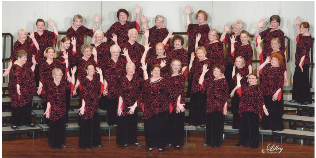
Seattle Shores Chorus at this year's competition in Spokane Washington held April 2nd. Our competition songs were Back in the Old Routine and Me and My Shadow. See back page for the Region 13 Competition 2011 Results.